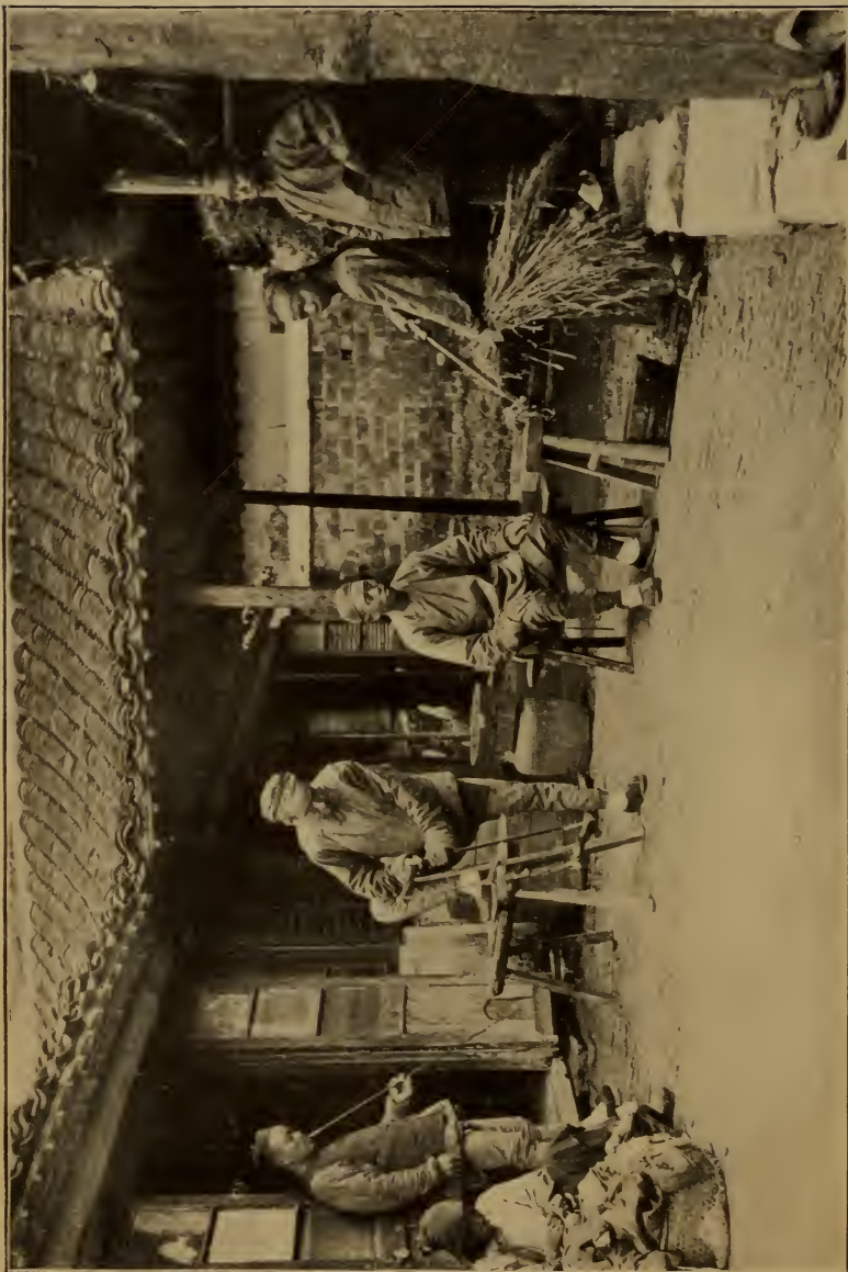
CHINESE VILLAGERS AT HOME.